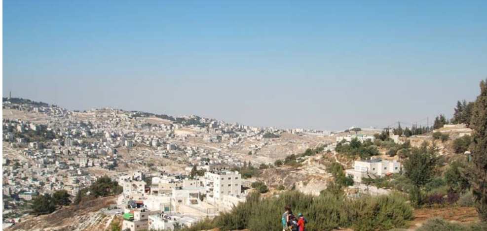
The Holy Land