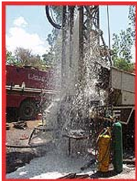
Wells of Hope Providing Life-Giving Water