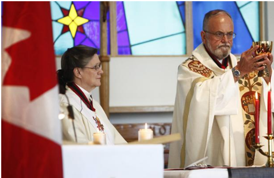
Holy Communion at Simon Peter's Inaugural Investiture